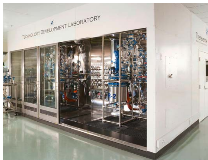
Customized Büchi facility for Theravance.