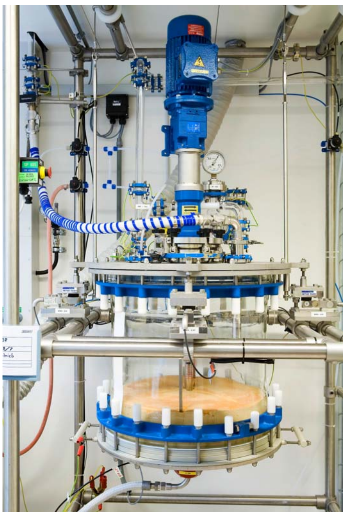
Customized SPPS reactor for Bachem.

In early 2009 Theravance Inc., a South San Francisco based biopharmaceutical company